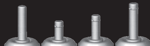
437 X 1 7/8 437S X 1 437S X 1 5/16 437S X 1 7/8