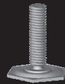
Threaded Stem HW

*Specialty stem lengths available upon request.