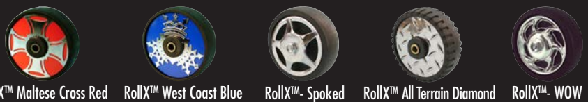
RollX™ Maltese Cross Red RollX™ West Coast Blue RollX™ Spoked RollX™ All Terrain Diamond RollX™ WOW

STANDARD PLATE: A47H Plate Thickness: 1/4"