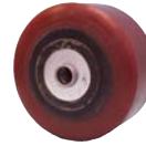
MOLDON URETHANE - TB